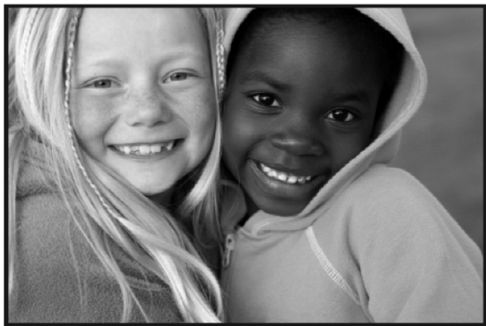
• Ask about New Patient Incentives