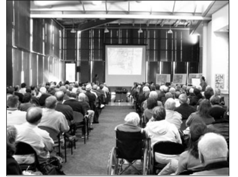
Two hundred people view the map projection at Warner Park Center

Especially contentious was the plan's designation of the Wheeler Road/Comanche Way northwest cor-